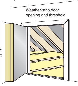
Foil-faced rigid insulation sandwiched together

Attic kneewall doors should be tightly weather-stripped, have a secure closure and have increased insulation R-value on the door (this can be achieved by gluing several inches of insulating foam board to the attic side of the door with construction adhesive and fastening with screws and washers - see below).